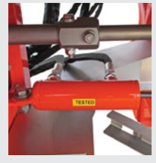
Double acting hydraulic control for the opening and closing of the fertilizer gates

This system can also be integrated with the GPS satellite devices.