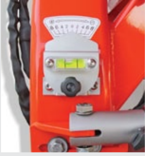
Tilt regulator for late spreading