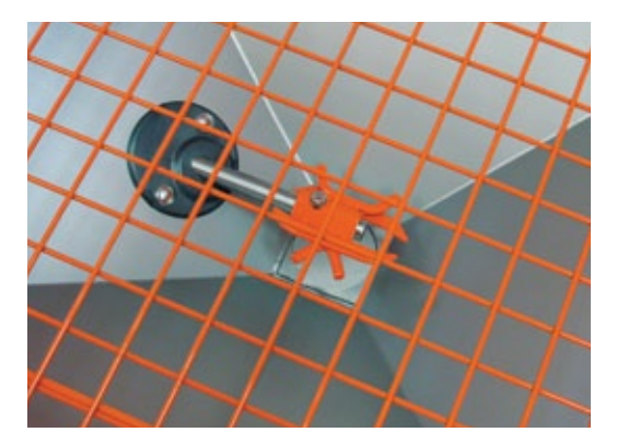
Standard filtering grids and mixer with ultra-slow rotation

All components in contact with the fertilizer are in stainless steel.