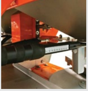
Distributor for the quantity of fertilizer to be spread