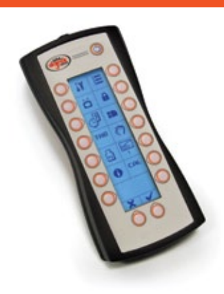
Spreading controlled by a computer for data management

It allows the totally automatic adjustment of the quantity of fertilizer to be spread (kg/ha) regardless the forward speed of the tractor, thus avoiding waste of fertilizer in respect of the environment.