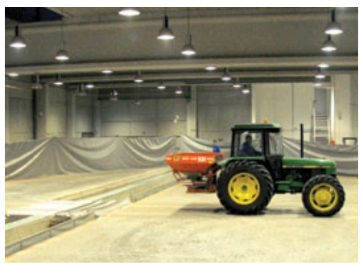
Spreading tests carried out at recognized university testing centers: Denmark [AARHUS Universitet] and Spain